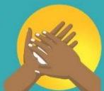
RUB HANDS TOGETHER