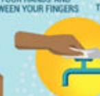
USE THE TOWEL TO TURN OFF THE FAUCET