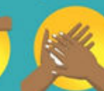
RUB HANDS TOGETHER