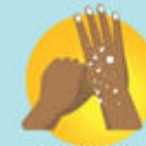
CLEAN THUMBS WASH FINGERNAILS AND FINGERTIPS