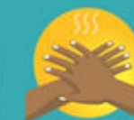
COVER ALL SURFACES UNTIL HANDS FEEL DRY