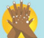
LATHER THE BACKS OF YOUR HANDS AND BETWEEN YOUR FINGERS