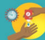
APPLY THE PRODUCT ON THE PALM OF ONE HAND