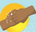
RUB THE BACKS OF FINGERS ON THE OPPOSING PALMS