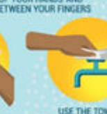
USE THE TOWEL TO TURN OFF THE FAUCET