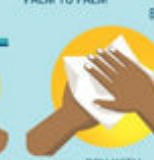
DRY WITH A SINGLE USE TOWEL