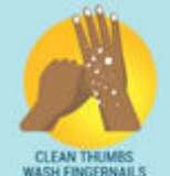
CLEAN THUMBS WASH FINGERNAILS AND FINGERTIPS