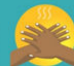
COVER ALL SURFACES UNTIL HANDS FEEL DRY