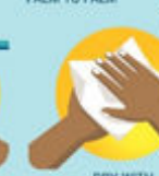
DRY WITH A SINGLE USE TOWEL