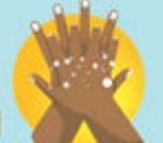
LATHER THE BACKS OF YOUR HANDS AND BETWEEN YOUR FINGERS