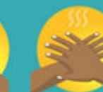
COVER ALL SURFACES UNTIL HANDS FEEL DRY