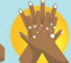
LATHER THE BACKS OF YOUR HANDS AND BETWEEN YOUR FINGERS