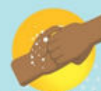
RUB THE BACKS OF FINGERS ON THE OPPOSING PALMS