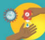
APPLY THE PRODUCT ON THE PALM OF ONE HAND