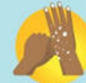
CLEAN THUMBS WASH FINGERNAILS AND FINGERTIPS