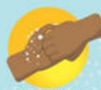
RUB THE BACKS OF FINGERS ON THE OPPOSING PALMS