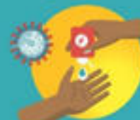
APPLY THE PRODUCT ON THE PALM OF ONE HAND