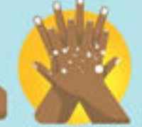
LATHER THE BACKS OF YOUR HANDS AND BETWEEN YOUR FINGERS