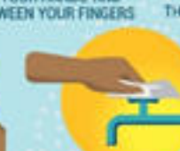
USE THE TOWEL TO TURN OFF THE FAUCET