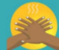
COVER ALL SURFACES UNTIL HANDS FEEL DRY