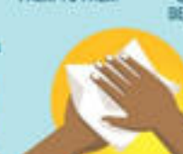
DRY WITH A SINGLE USE TOWEL