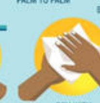
DRY WITH A SINGLE USE TOWEL