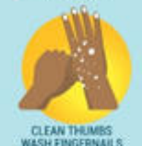
CLEAN THUMBS WASH FINGERNAILS AND FINGERTIPS