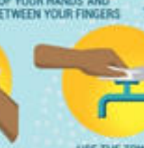
USE THE TOWEL TO TURN OFF THE FAUCET