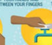
USE THE TOWEL TO TURN OFF THE FAUCET