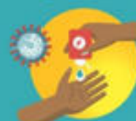
APPLY THE PRODUCT ON THE PALM OF ONE HAND