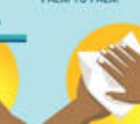
DRY WITH A SINGLE USE TOWEL