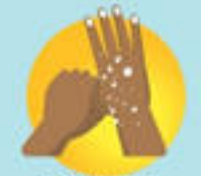
CLEAN THUMBS WASH FINGERNAILS AND FINGERTIPS