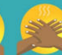
COVER ALL SURFACES UNTIL HANDS FEEL DRY