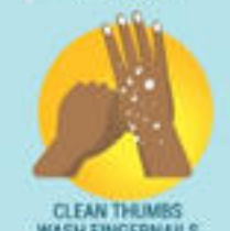
CLEAN THUMBS WASH FINGERNAILS AND FINGERTIPS