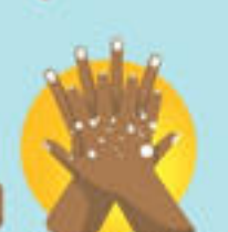
LATHER THE BACKS OF YOUR HANDS AND BETWEEN YOUR FINGERS