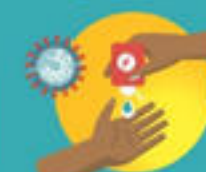
APPLY THE PRODUCT ON THE PALM OF ONE HAND