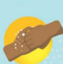
RUB THE BACKS OF FINGERS ON THE OPPOSING PALMS