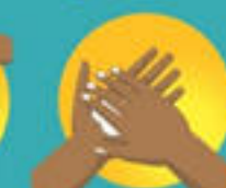
RUB HANDS TOGETHER