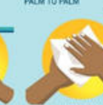
DRY WITH A SINGLE USE TOWEL