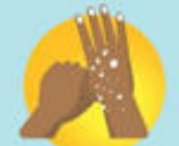
CLEAN THUMBS WASH FINGERNAILS AND FINGERTIPS