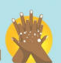
LATHER THE BACKS OF YOUR HANDS AND BETWEEN YOUR FINGERS