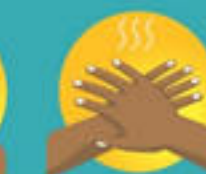
COVER ALL SURFACES UNTIL HANDS FEEL DRY