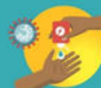
APPLY THE PRODUCT ON THE PALM OF ONE HAND