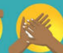
RUB HANDS TOGETHER