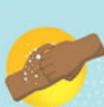
RUB THE BACKS OF FINGERS ON THE OPPOSING PALMS