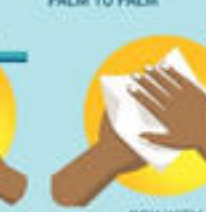
DRY WITH A SINGLE USE TOWEL