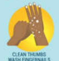
CLEAN THUMBS WASH FINGERNAILS AND FINGERTIPS