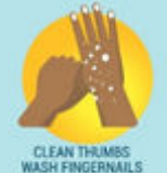
CLEAN THUMBS WASH FINGERNAILS AND FINGERTIPS