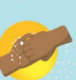
RUB THE BACKS OF FINGERS ON THE OPPOSING PALMS