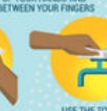
USE THE TOWEL TO TURN OFF THE FAUCET