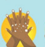
LATHER THE BACKS OF YOUR HANDS AND BETWEEN YOUR FINGERS