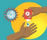
APPLY THE PRODUCT ON THE PALM OF ONE HAND