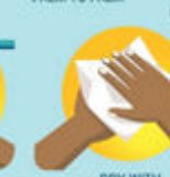
DRY WITH A SINGLE USE TOWEL