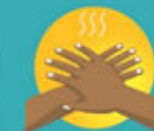
COVER ALL SURFACES UNTIL HANDS FEEL DRY