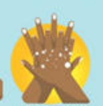
LATHER THE BACKS OF YOUR HANDS AND BETWEEN YOUR FINGERS