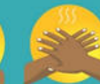
COVER ALL SURFACES UNTIL HANDS FEEL DRY