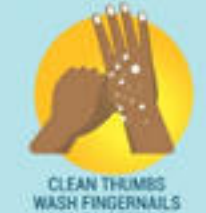
CLEAN THUMBS WASH FINGERNAILS AND FINGERTIPS