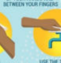
USE THE TOWEL TO TURN OFF THE FAUCET