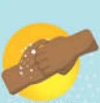
RUB THE BACKS OF FINGERS ON THE OPPOSING PALMS