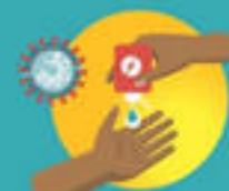
APPLY THE PRODUCT ON THE PALM OF ONE HAND