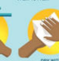
DRY WITH A SINGLE USE TOWEL