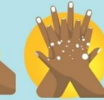
LATHER THE BACKS OF YOUR HANDS AND BETWEEN YOUR FINGERS