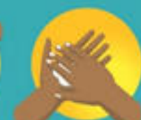
RUB HANDS TOGETHER