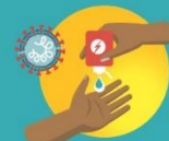
APPLY THE PRODUCT ON THE PALM OF ONE HAND