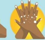
LATHER THE BACKS OF YOUR HANDS AND BETWEEN YOUR FINGERS