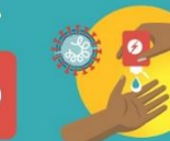
APPLY THE PRODUCT ON THE PALM OF ONE HAND