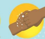
RUB THE BACKS OF FINGERS ON THE OPPOSING PALMS