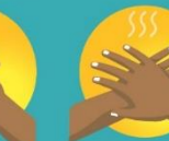
COVER ALL SURFACES UNTIL HANDS FEEL DRY