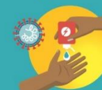
APPLY THE PRODUCT ON THE PALM OF ONE HAND