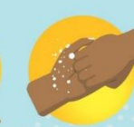
RUB THE BACKS OF FINGERS ON THE OPPOSING PALMS