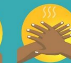
COVER ALL SURFACES UNTIL HANDS FEEL DRY