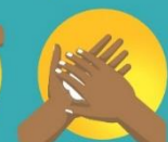
RUB HANDS TOGETHER