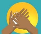
RUB HANDS TOGETHER