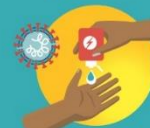
APPLY THE PRODUCT ON THE PALM OF ONE HAND