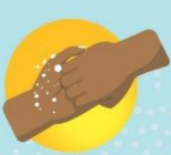
RUB THE BACKS OF FINGERS ON THE OPPOSING PALMS