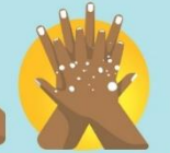
LATHER THE BACKS OF YOUR HANDS AND BETWEEN YOUR FINGERS