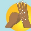
CLEAN THUMBS WASH FINGERNAILS AND FINGERTIPS