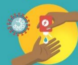
APPLY THE PRODUCT ON THE PALM OF ONE HAND