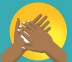
RUB HANDS TOGETHER