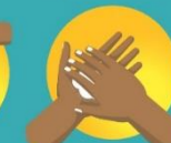
RUB HANDS TOGETHER