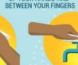
USE THE TOWEL TO TURN OFF THE FAUCET