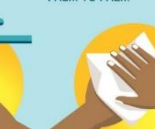
DRY WITH A SINGLE USE TOWEL