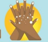
LATHER THE BACKS OF YOUR HANDS AND BETWEEN YOUR FINGERS