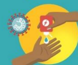
APPLY THE PRODUCT ON THE PALM OF ONE HAND