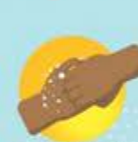
RUB THE BACKS OF FINGERS ON THE OPPOSING PALMS