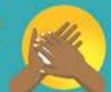
RUB HANDS TOGETHER