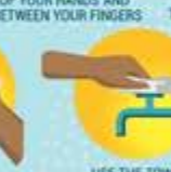
USE THE TOWEL TO TURN OFF THE FAUCET